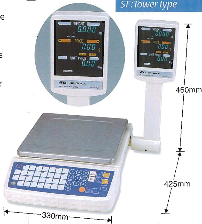
SF: Tower type