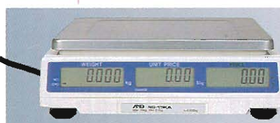
Shown connected to ET-S616 cash register Rear View (SG Series)