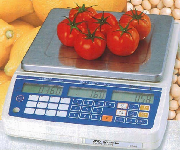
SG-15KA Table top type