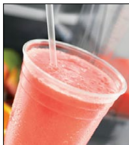
Strawberry Orange Smoothie